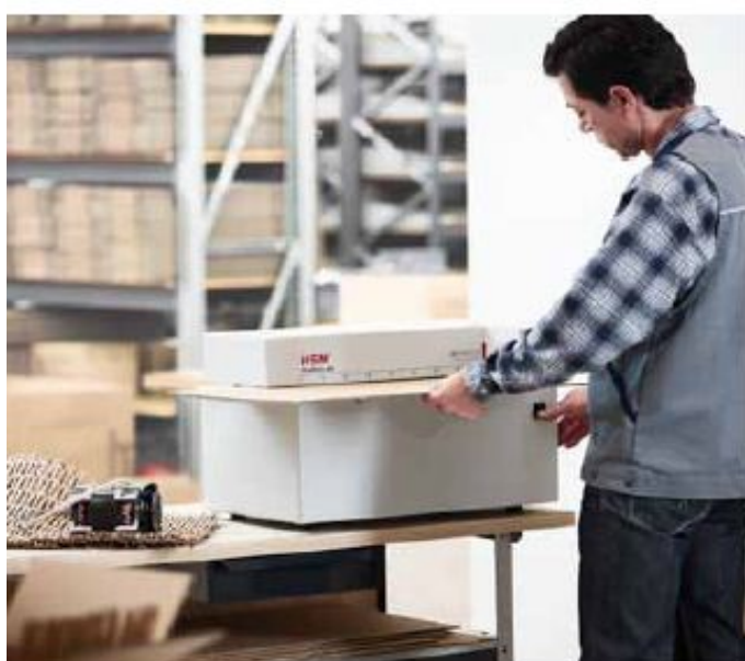
HSM ProfiPack 400