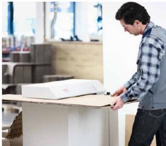
HSM ProfiPack 425